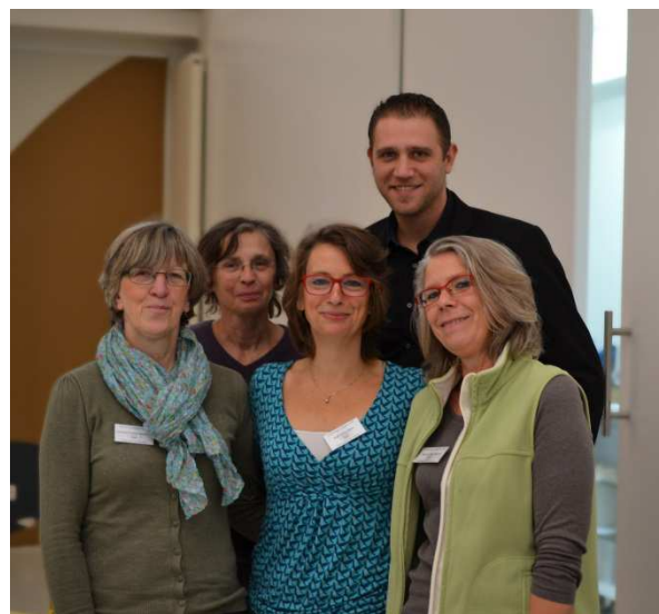
Organizing team of the Royal Belgian Entomological Society.