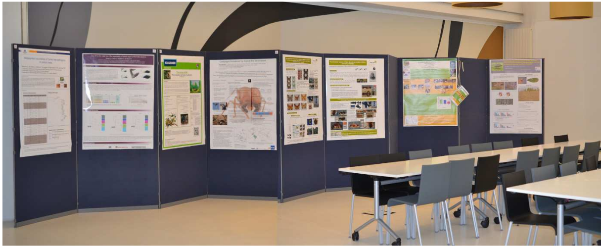
Some of the presented posters at the symposium.

We hope that within two years a 6th edition of the Symposium will be as successful as this one.